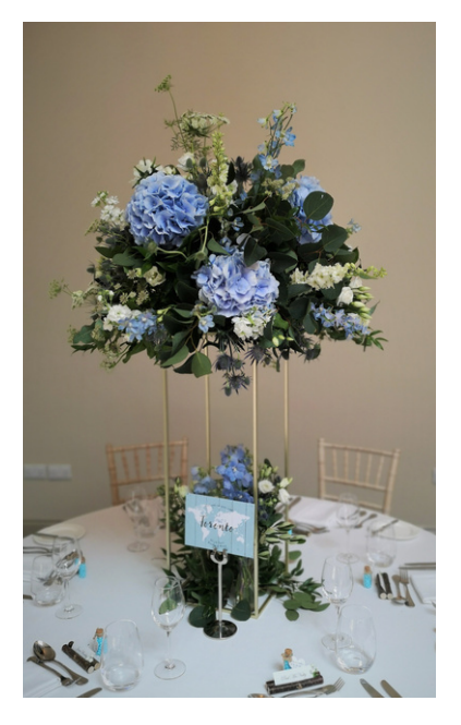
GOLD GEOMETRIC Modern, sleek and stylish gold stand that can

If you have chosen a venue that has a large square footage, high ceilings or you envisage wowing your guests then it's worth having a look at the tall table centre options on this page. Each stand can be styled beautifully with a bespoke floral arrangement that reflects your wedding vision perfectly. All the stands are suitable to allow guests to see across the table.