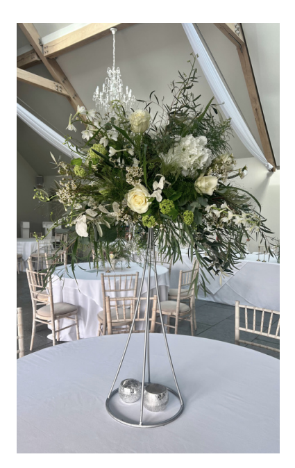
SILVER TIPI STAND

PRICING FROM : Hire + floral design | £125 - £250 each